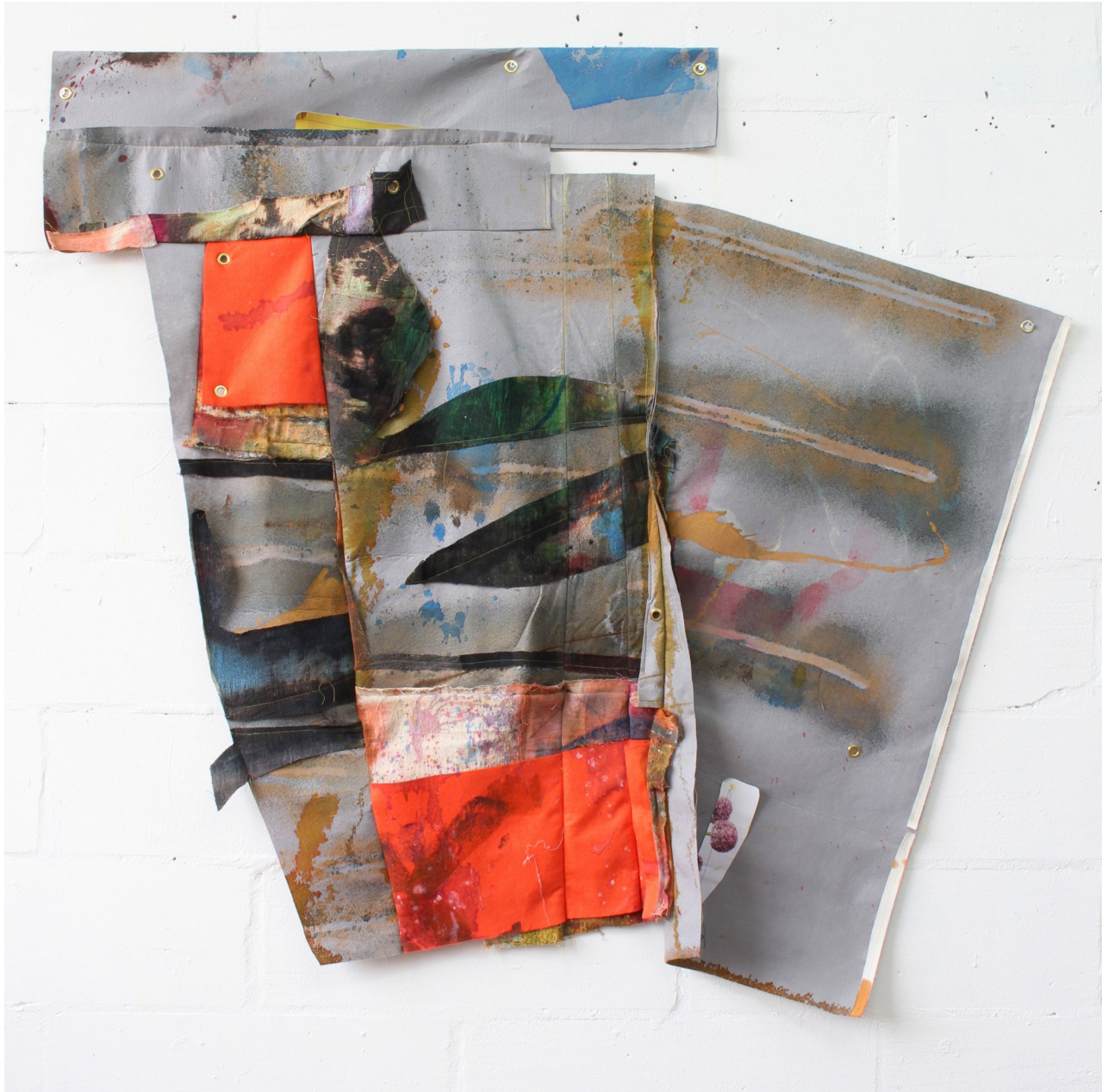
Dark Places (2021), ink, dye, bleach, collage and canvas on stitched felt, brass grommets, 138 x 155 cm