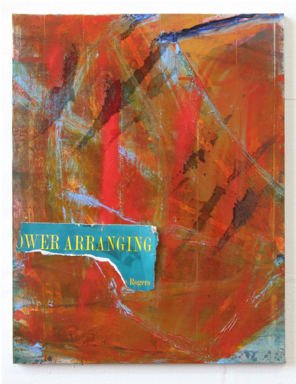
Power Arranging , (2021), oil paint, collage and aluminium tape on aluminium panel, 45 x 35cm