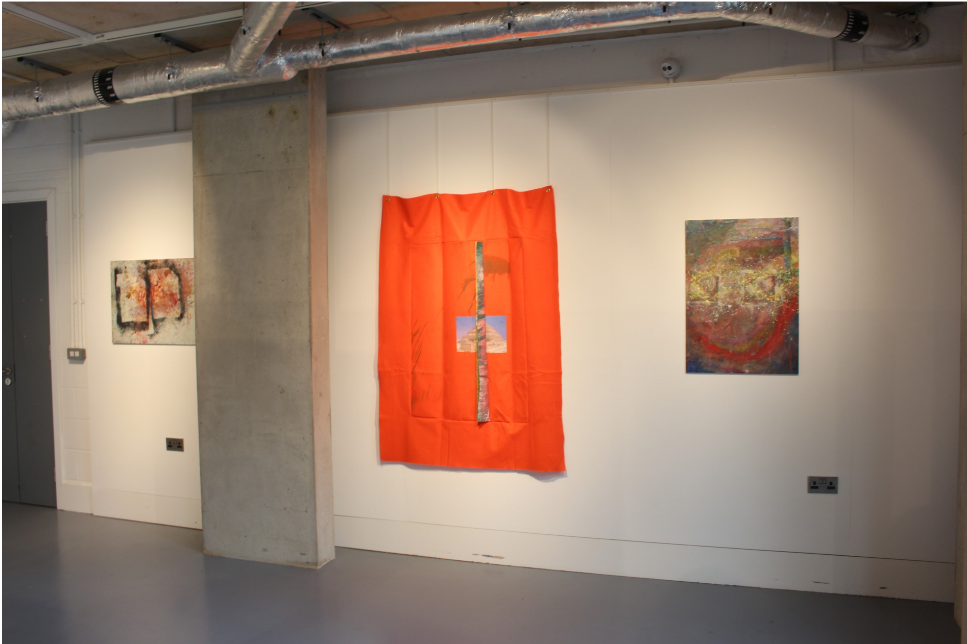
Installation view of Glide Gracefully in a Diagonal Movement , noformat Gallery, London, UK, 2021