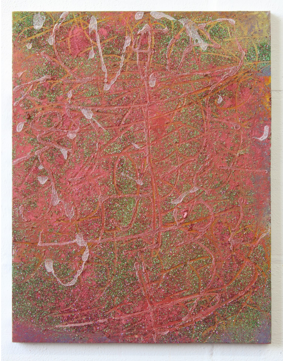
The City , (2021), oil paint and glitter on aluminium panel, 45.5 x 35 cm