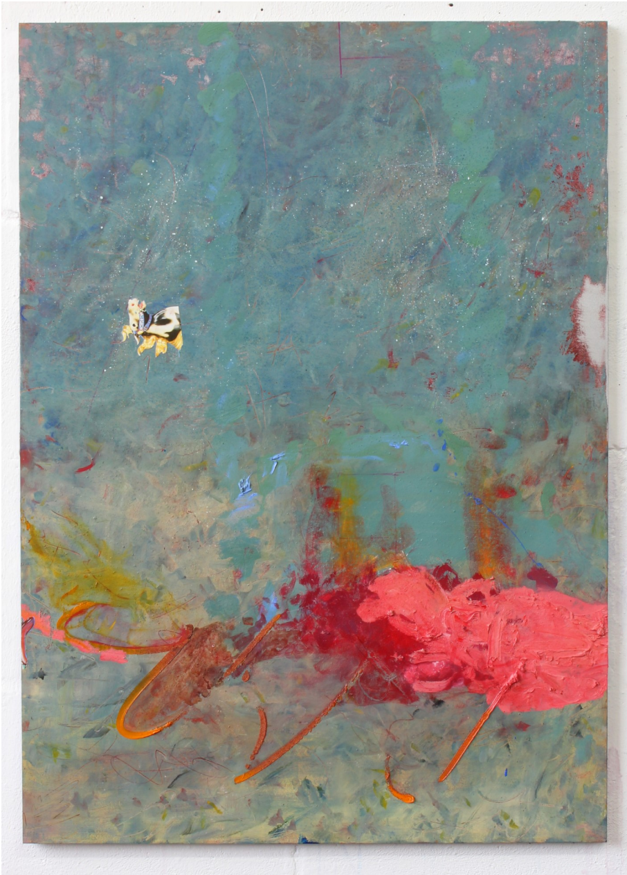
Sticker Horse (2021), oil paint, raw pigment, pen and collage on aluminium panel, 79 x 56.5 cm