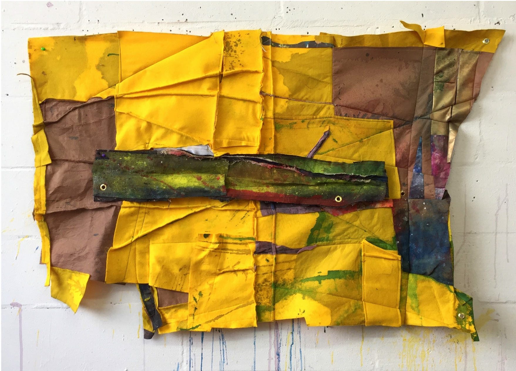
Sandcastle , (2021), ink, dye, bleach and acrylic on stitched felt, fake leather, brass grommets, 100 x 160 cm