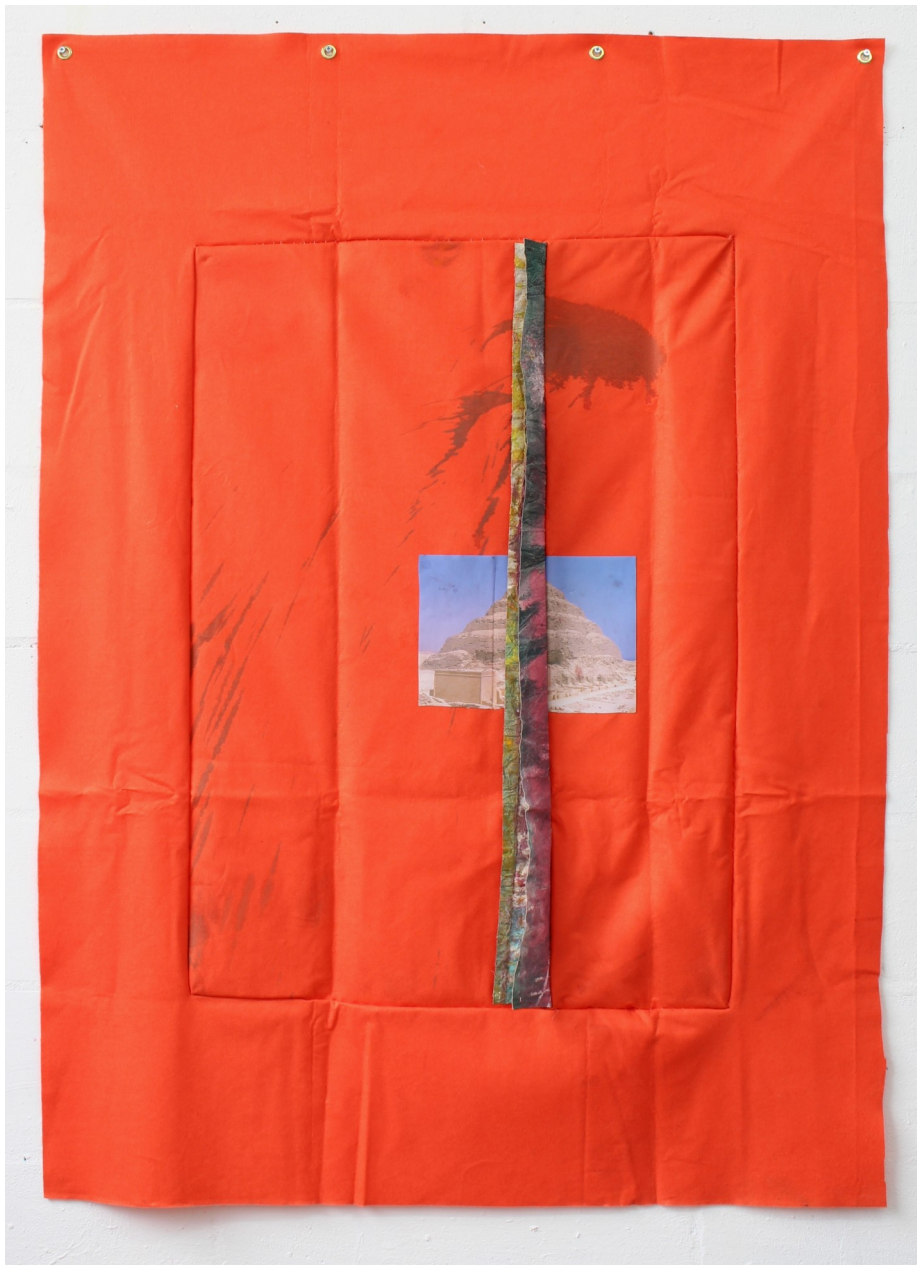
Untitled (Pyramid) (2021), ink, collage, canvas and acrylic on stitched felt, brass grommets 150 x 100 cm