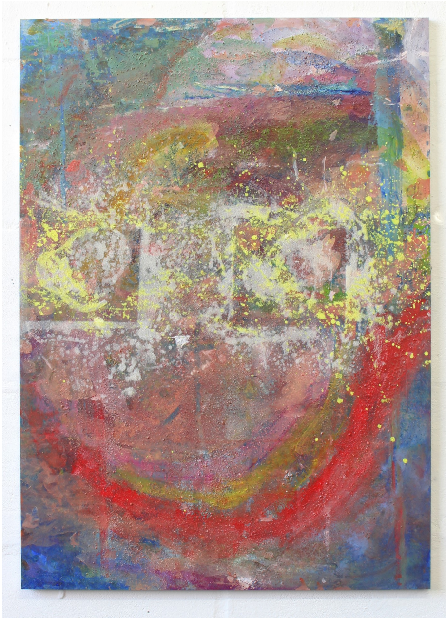
Clown Face (2021), oil paint, pigment and glitter on aluminium panel, 79 x 56.5 cm