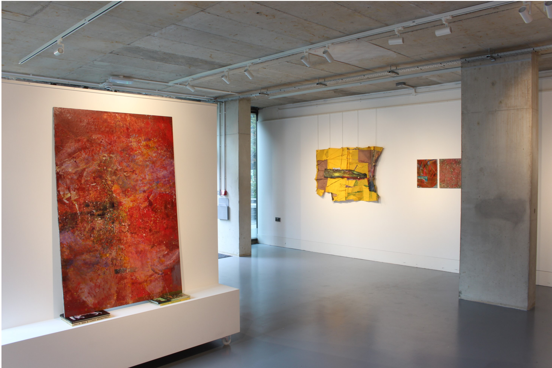
Installation view of Glide Gracefully in a Diagonal Movement , noformat Gallery, London, UK, 2021