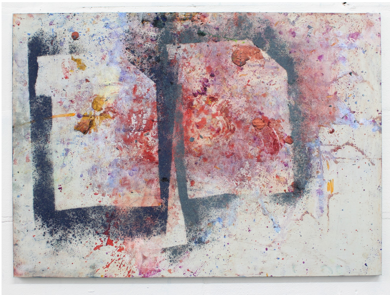
Two Attractive Line Designs , (2020), oil paint, oil stick and pigment on aluminium panel, 56.5 x 79 cm