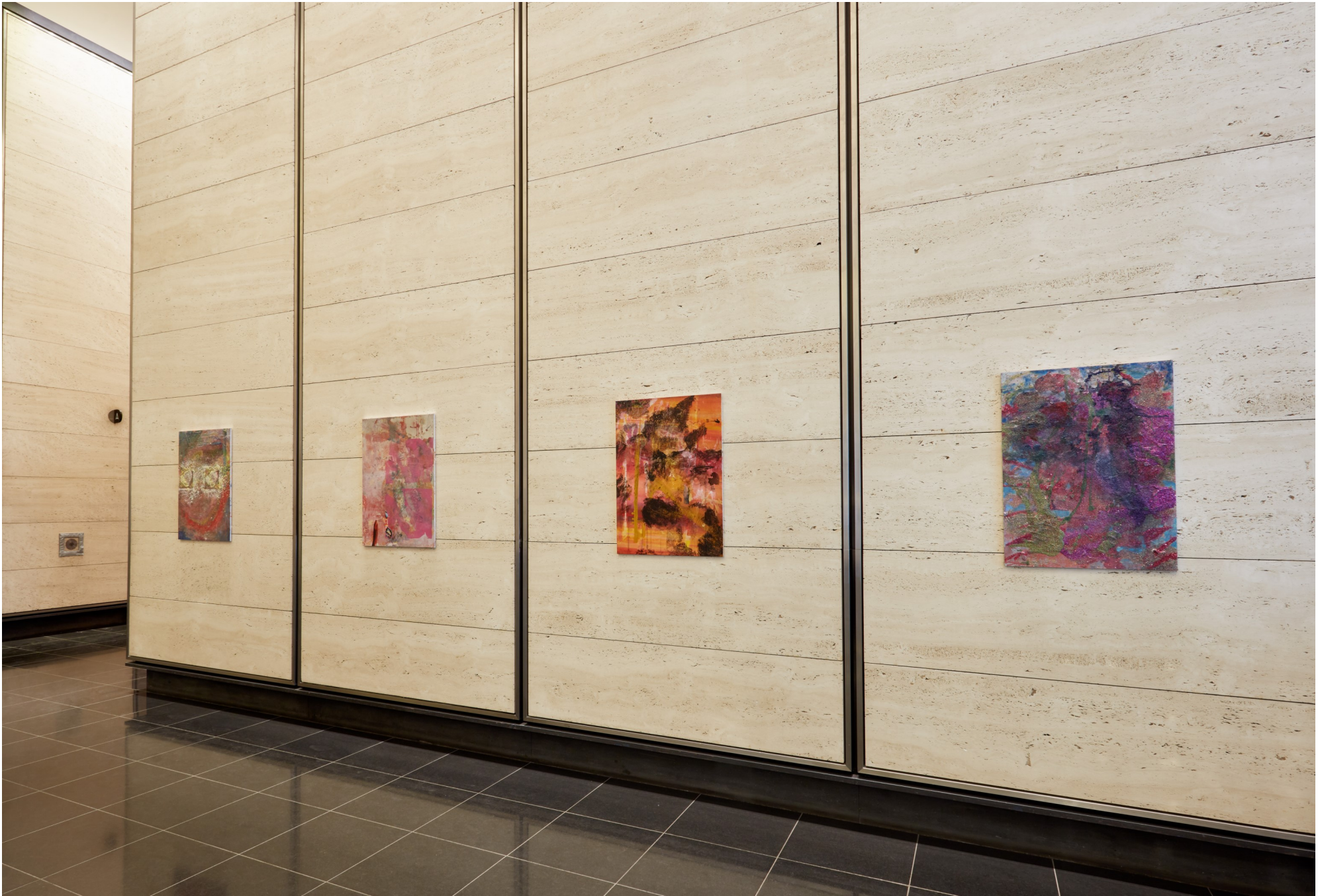
Installation of Bouquets , ArtMoorhouse London, 2023