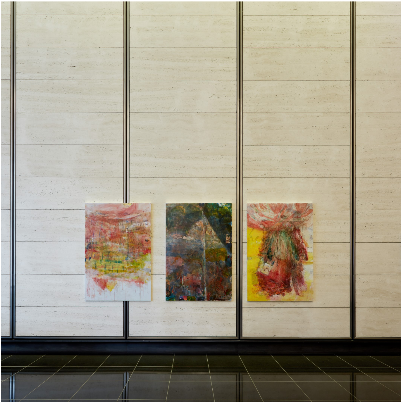
Installation of Bouquets , ArtMoorhouse London, 2023