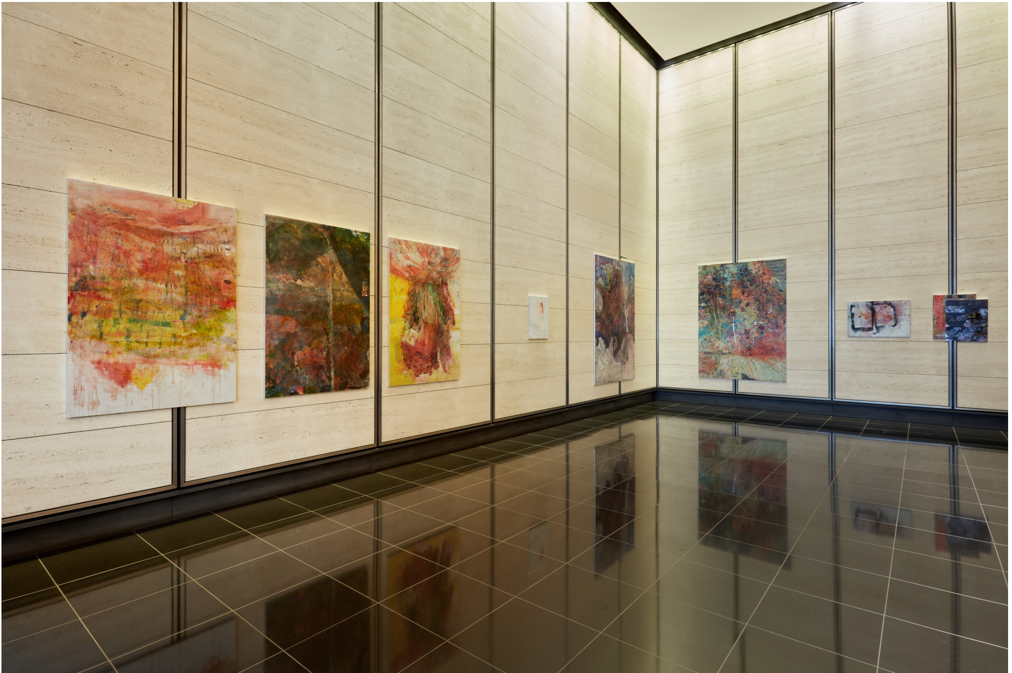
Installation of Bouquets , ArtMoorhouse London, 2023