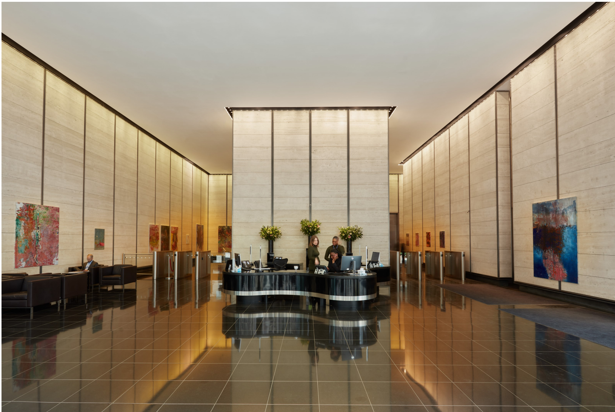
Installation of Bouquets , ArtMoorhouse London, 2023