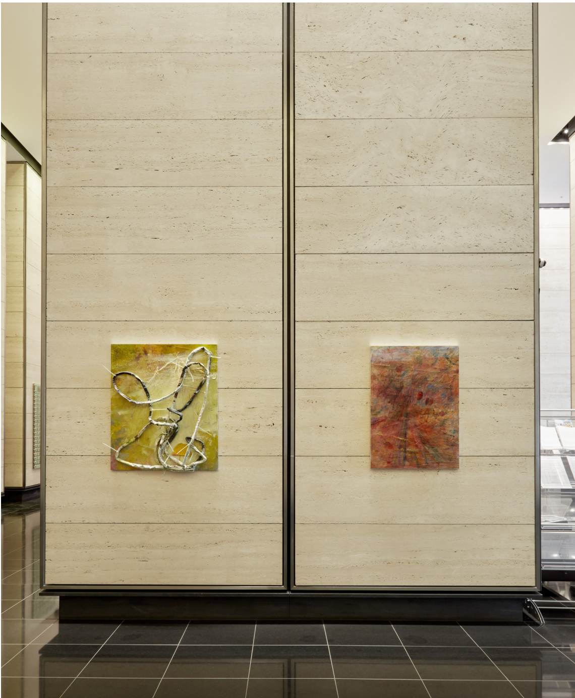
Installation of Bouquets , ArtMoorhouse London, 2023