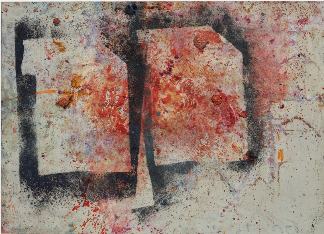
Two Attractive Line Designs