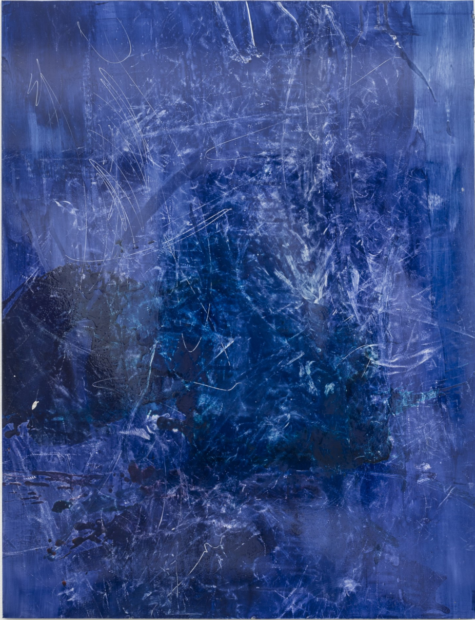
Gooseflesh (2019), oil paint on aluminium panel, 150 x 110 cm