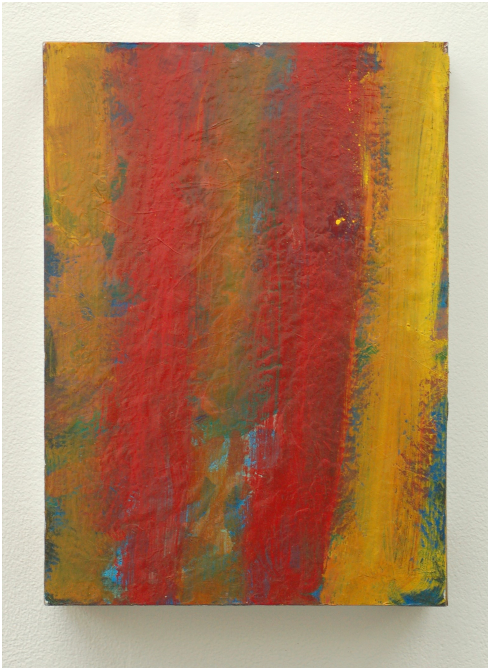
EM with Box (2019), oil paint, aluminium foil, aluminium panel, foam board, parcel tape, 30 x 20 x 8 cm