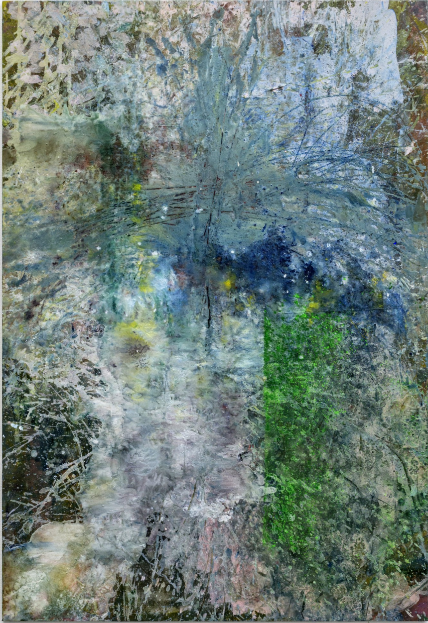
Landing (2019), oil paint, raw pigment, foam board, aluminium tape and glue on aluminium panel, 121 x 81 cm