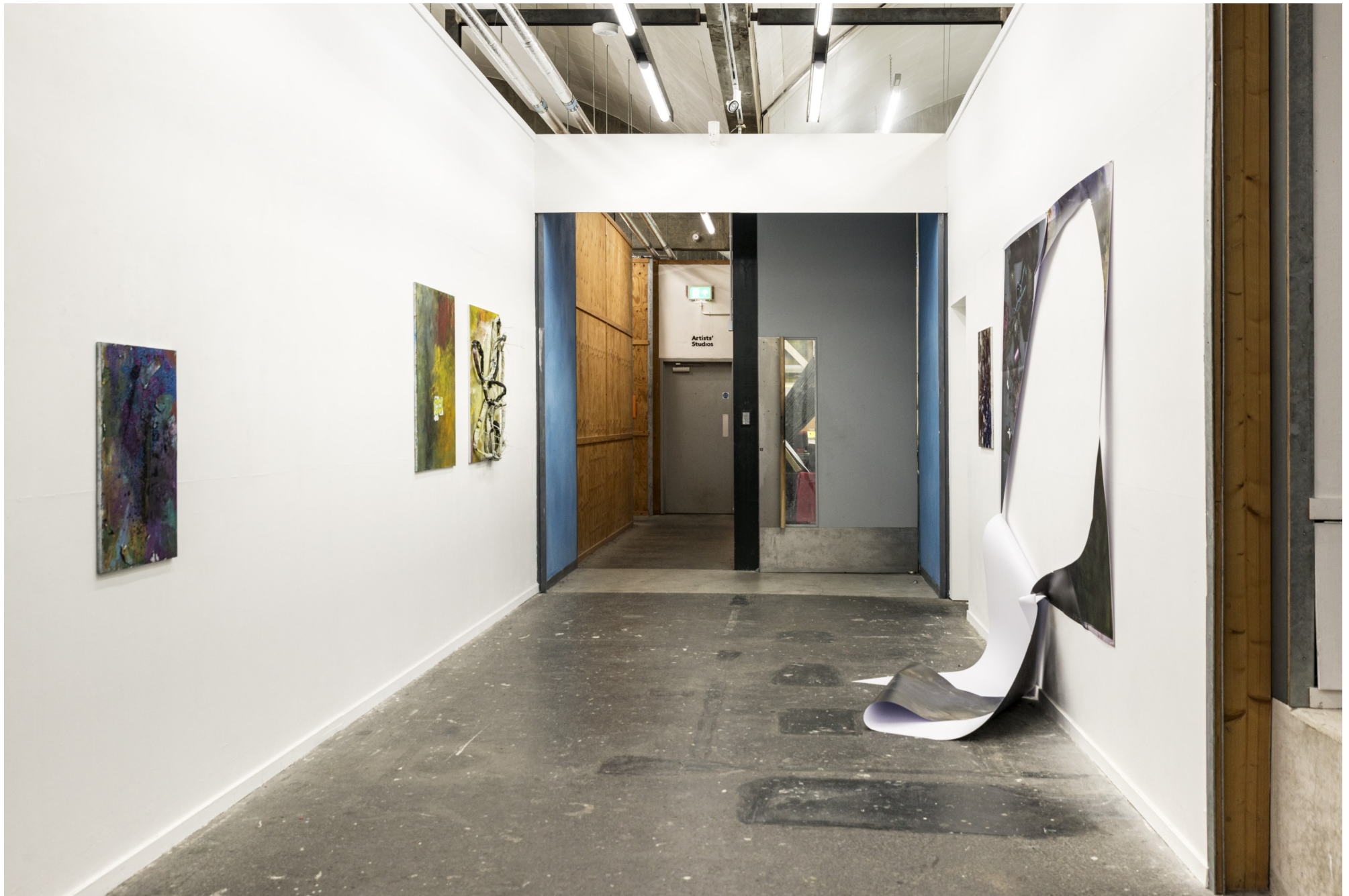
Stainer , Spike Island Test Space, Bristol, UK, Installation View