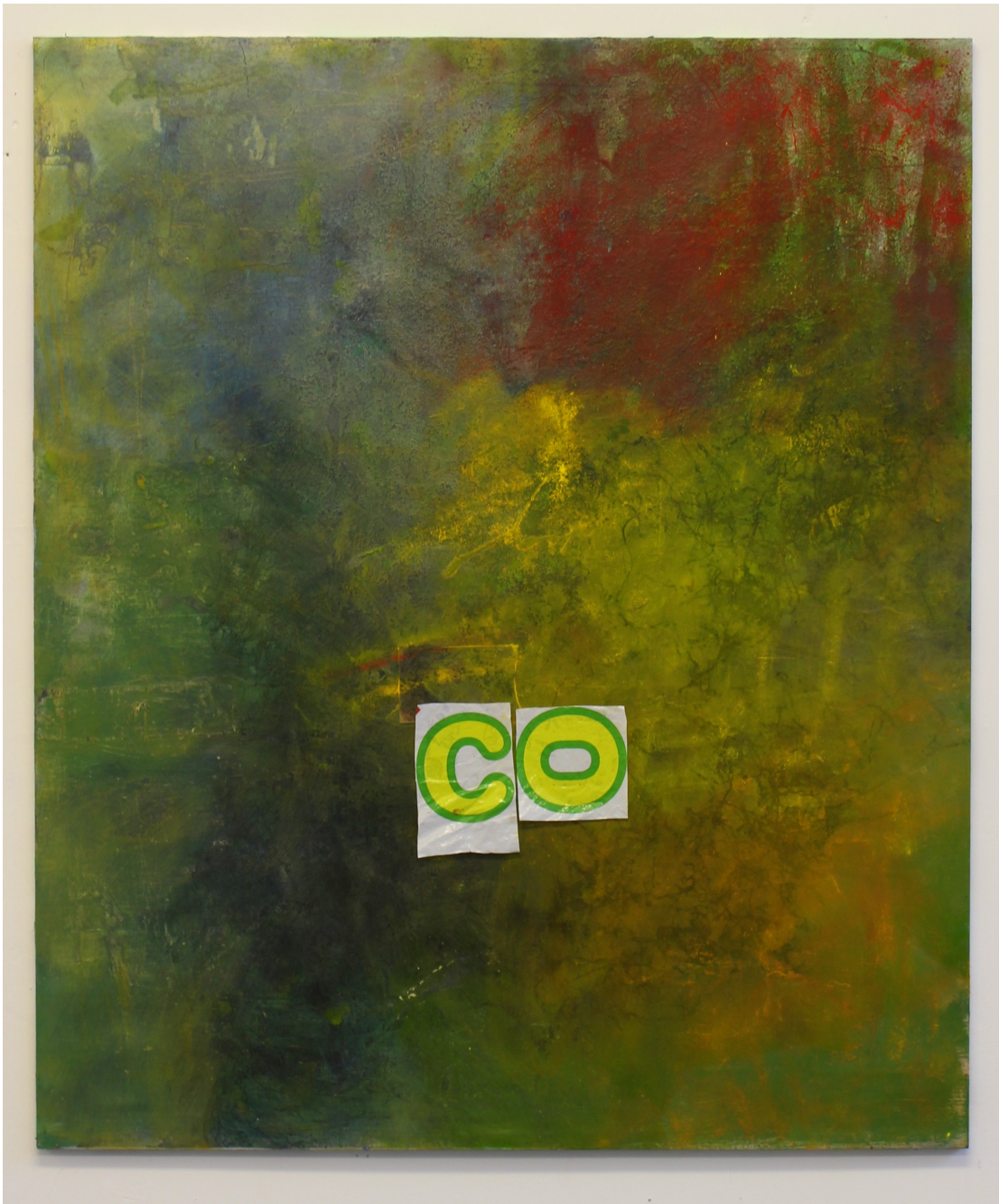
Loneliness is Something Earned (2019), oil paint, raw pigment, glue and plastic bag on aluminium panel, 95 x 80 cm