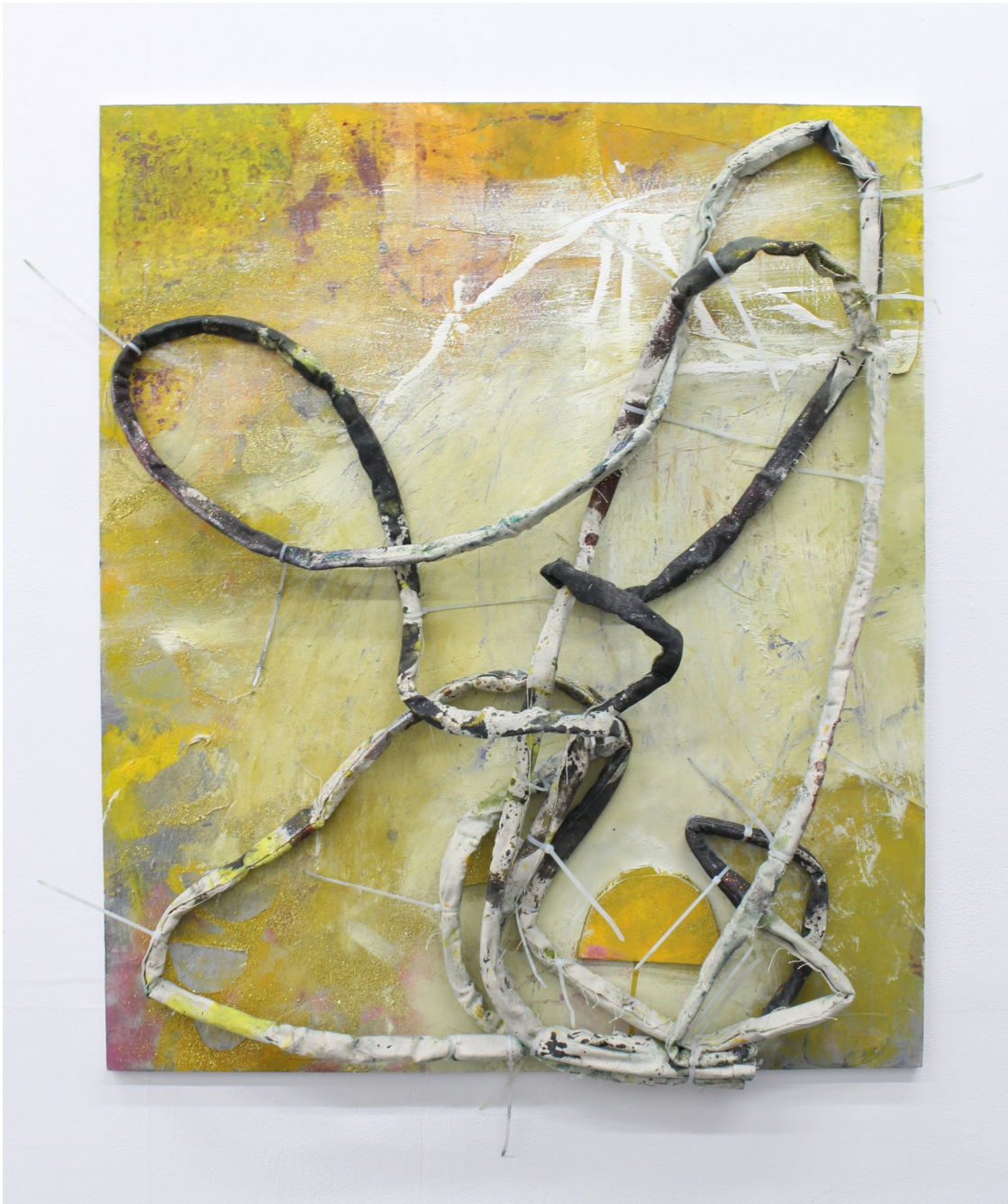
Field Study (2020), oil paint, paper, canvas, foam board, Plextol, silicon, glitter, cable ties, glue and raw pigment on