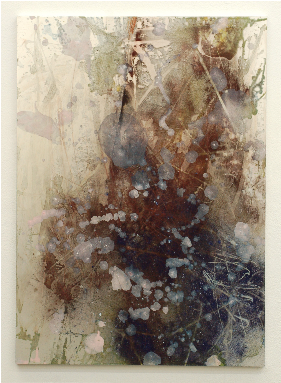
Spot (2019), oil paint and raw pigment on aluminium panel, 70 x 50 cm