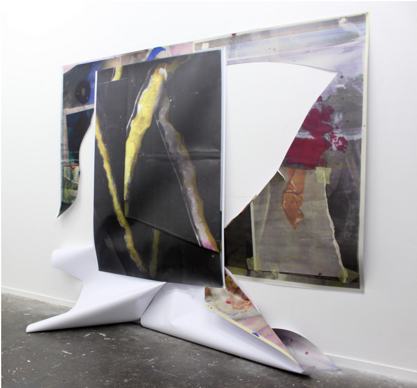
Rinkoff (2020), digital print, pins, knife mark in wall, 226 x 266 cm